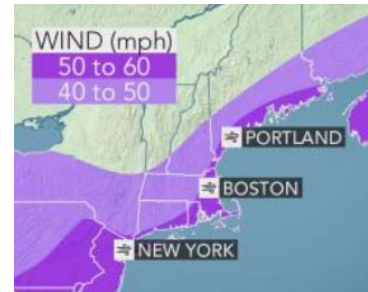
2 - Expected Wind Gusts