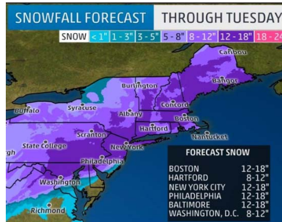
4 - Stella Expected Snow Amounts

Beginning over the weekend of March 11th, weather forecasters began reporting a significant nor'easter expected to move across and impact the northeast Tuesday (Mar 14 th ) with heavy snow amounts (12-18+ inches), strong wind gusts (50-60+ mph) and a wintry mix expected for coastal areas. Winter weather advisories and warnings were issued and updated in the days leading up to the storm for most of the Mid-Atlantic and Northeast. Initial weather forecasts called for up to 22 inches of snow with wind gusts up to 55 mph (and higher along the coast) which were later decreased although only slightly (weather forecast provided in Section 4.5). Stella broke snowfall records in the City of Concord and also caused hazardous travel conditions and widespread customer interruptions due to fallen trees and limbs.