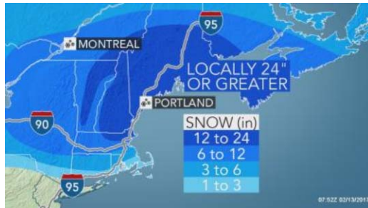
1 - Expected Snow Totals

Beginning on Friday February 10 th , Unitil's weather service provider began forecasting a moderately wet snow event to impact the region Sunday (12 th ) into Monday (13 th ) with a total snow amount of around 12 inches expected. Additional warnings were given for the southern and coastal areas in the region where warmer temperatures were predicted to cause some of the snow to be wet in nature. Overall the temperatures remained favorable (cooler) resulting in about 10-12 inches of snow to fall across the region with a dryer consistency which caused only minor interruptions.